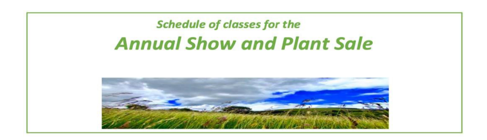
Saturday 22<sup>nd</sup> July 2023